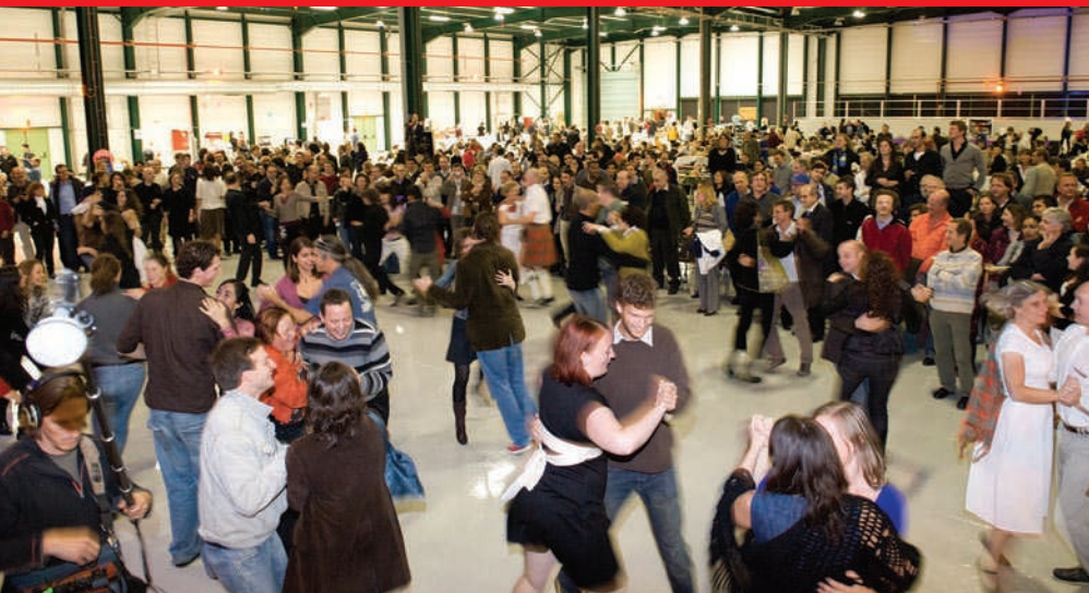
Like a giant commune, members of the ATLAS collaboration work, eat and party together.

Institute of Technology in Atlanta who studied the collaboration structure at CERN before the formation of ATLAS, agrees that there is no simple top-down decision-making at the laboratory. However, he notes that the word “commune” implies that there is little rivalry between the members of the collaboration. By contrast, he says, the collaboration thrives on healthy “organized competition” between subgroups working to build different components for the detector quickly and effectively.