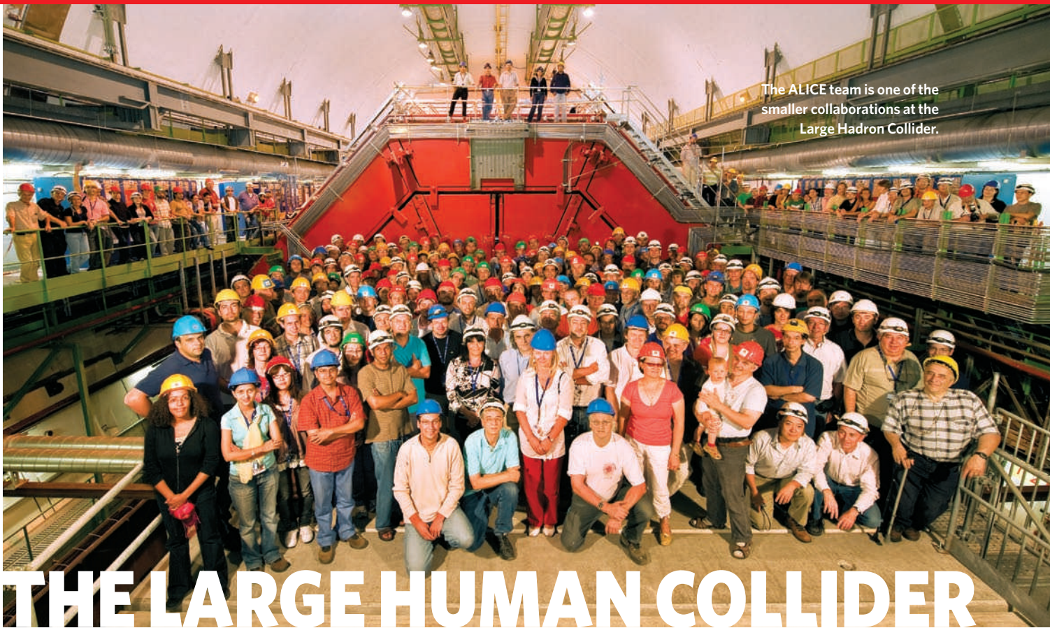
The ALICE team is one of the smaller collaborations at the Large Hadron Collider.